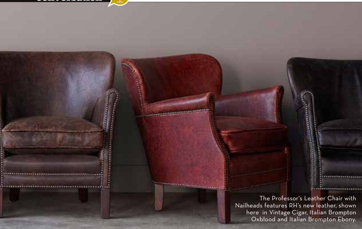
The Professor's Leather Chair with Nailheads features RH's new leather, shown here in Vintage Cigar, Italian Brompton Oxblood and Italian Brompton Ebony.